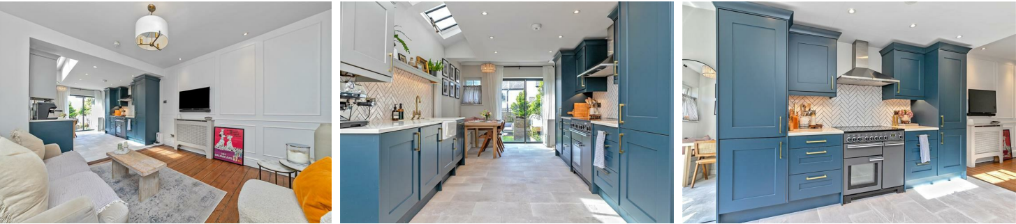
Ground Floor Approx. 449.5 sq. feet

Nestled in the heart of St. Albans on the desirable Pageant Road, this charming terraced house offers a perfect blend of period features and modern living. Having undergone a comprehensive renovation in 2018, the property boasts a stylish rear extension and a loft conversion, providing ample space for comfortable modern living. Upon entering, you are greeted by an entrance hallway leading to two inviting reception rooms, each with its own character and warmth. The living area features a working fireplace, which serves as a delightful focal point, perfect for cosy evenings. The original wood flooring has been professionally restored, adding to the home's charm and elegance. The bespoke kitchen is a true highlight, showcasing exquisite Mandarin Stone tiled flooring. This space is ideal for those who enjoy cooking and entertaining. The property comprises three bedrooms, providing plenty of room for family or guests. With a modern bathroom and en-suite, morning routines will be a breeze, ensuring convenience for all. This delightful home is situated in a vibrant area, offering easy access to the city centre's amenities, including shops, restaurants, and parks. Whether you are looking for a family home or a stylish retreat, this property is sure to impress.